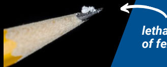
lethal dose of fentanyl